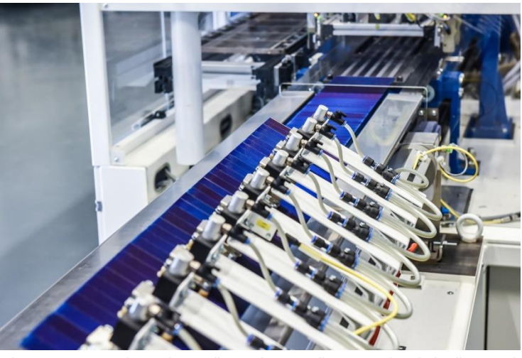
Pilot process to apply an electrically conductive adhesive to shingled cells carried out on the industrial stringer in the Module-TEC of Fraunhofer ISE.

PRESS RELEASE January 9, 2019 || Page 2 | 2